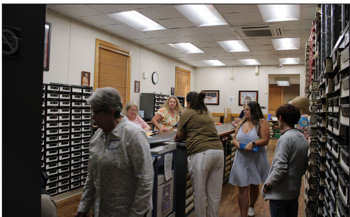
Poll workers secure vote data at the courthouse.