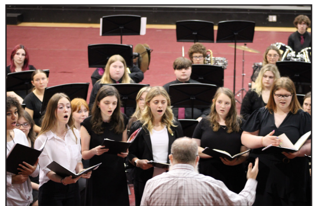
Members of the West Carter High School Bella Harmonia choir perform during their Spring concert last week.

There's certainly no shortage of skilled and talented musicians and performers in our small community. Last Thursday, nearly 40 young adults put that skill on display, joining together for the first combined choir and