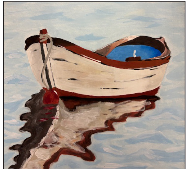
See ART on A-4

In addition, the Party Bus Band will present a free concert for the public at 8 p.m. on the GO Radio (WOGO/WGOH) Stage on Main Street. Those who'd