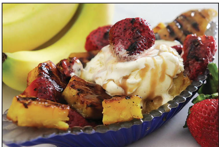
Summer sweetness grilled to perfection: Grilled fruit sundaes.

To assemble the sundaes: Remove the peel from the bananas, roughly chop then divide all the grilled fruit between 6 to 8 sundaes cups. To take this over the top, add a little sprinkle of salt to intensify the complex flavors of the caramelized sugars. Top each