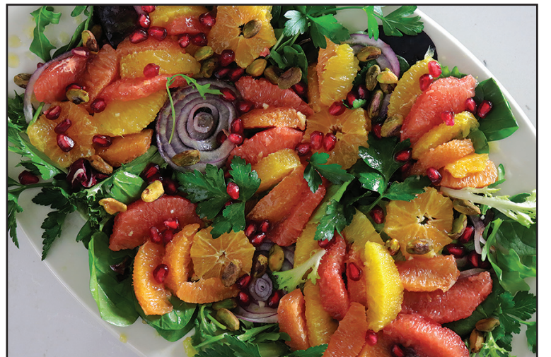
Turkey Meatballs are the perfect bite-size crowd-pleasers for your holiday gatherings.

(optional) Grilled chicken or fish (optional)