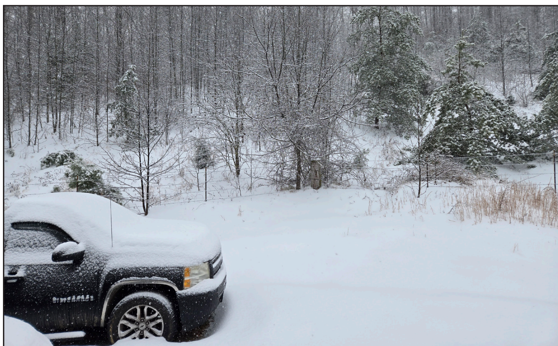
Several inches of snow and ice shut down businesses and schools this week.