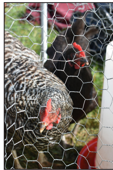
A pair of chickens rest in a crate during a trade days event.