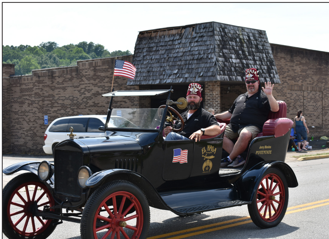
Participants in the Memory Days parade wave to the crowd.