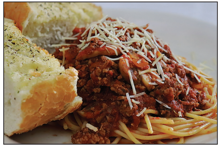
Delicious pasta sauce comes together quickly with batch-cooked beef.

Yield: 4 servings Total Time: 25 minutes