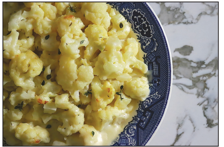
Creamy, cheesy and golden-baked -- this cauliflower au gratin turns a simple side into a showstopper

Cheese Variations: For a different flavor profile, try white cheddar (pictured), Gruyère, Swiss or smoked Gouda -- each