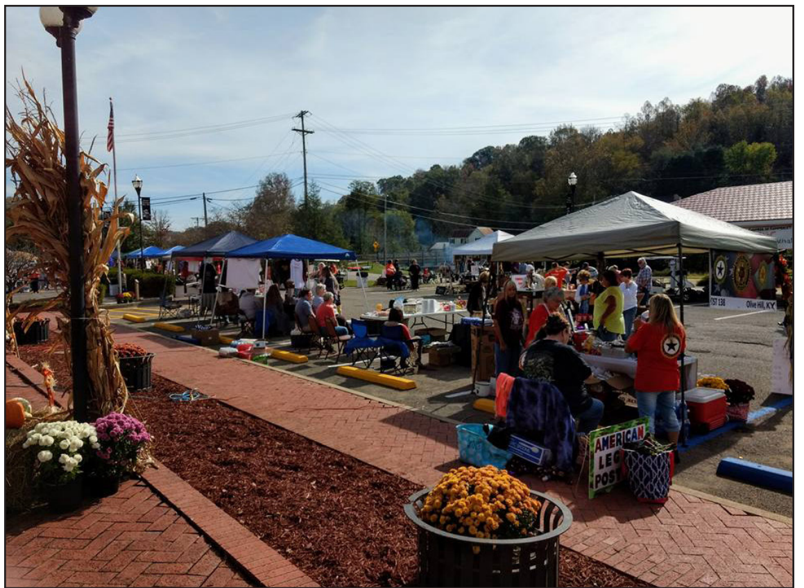
Vendors and shoppers mingle at last year's It's Fall Y'all event. (Submitted photo)